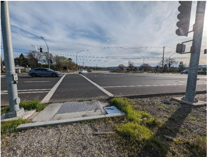
Existing Site Conditions